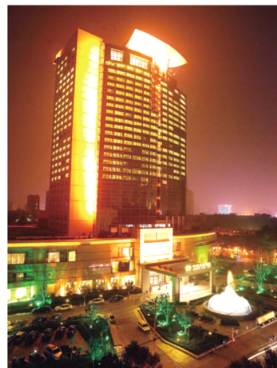
Room Types No. of Rooms